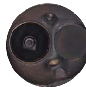
Cylinder head before P.i. treatment.