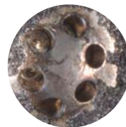
Injector after one P.i. treatment.