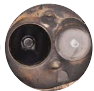
Cylinder head after one P.i. treatment.